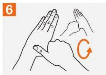
Rotational rubbing of left thumb clasped in right palm and vice versa;