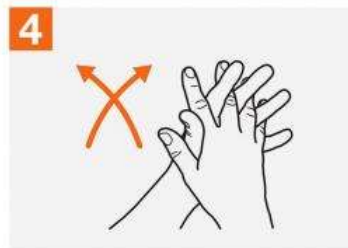
Palm to palm with fingers interlaced;