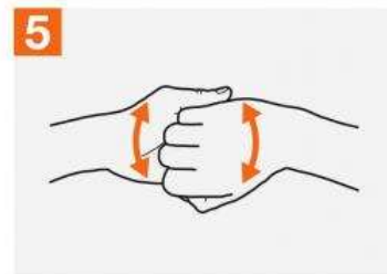
Backs of fingers to opposing palms with fingers interlocked;