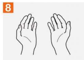
Once dry, your hands are safe.