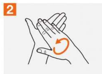
Rub hands palm to palm;