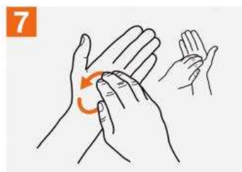
Rotational rubbing, backwards and forwards with clasped fingers of right hand in left palm and vice versa;