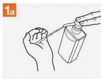
Apply a palmful of the product in a cupped hand, covering all surfaces;

🕒 Duration of the entire procedure: 20-30 seconds